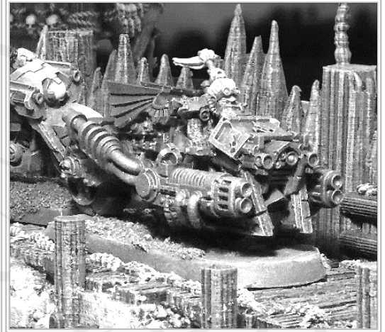
Model by Wargame Exclusive, Ramparts by Printable Scenery.

Wipeout: If reduced to 0 HP from Weapons or struck with a Mini Nuke, the Racer will suffer Wipeout. When this occurs, the Racer cannot Dash or Move until after the next Attack Phase and loses all its Gems. At the start of the next Attack Phase, the Racer restores all its HP. Wipeout counts as a Casualty for some Perks. Wipeout removes all Afflictions and Perk effects.