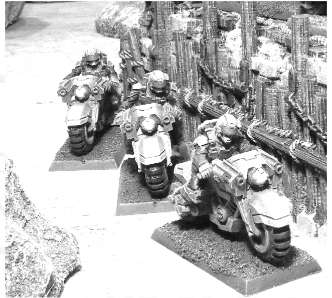
Models by Puppetswar, Gaming Mat by Deep-Cut Studio.