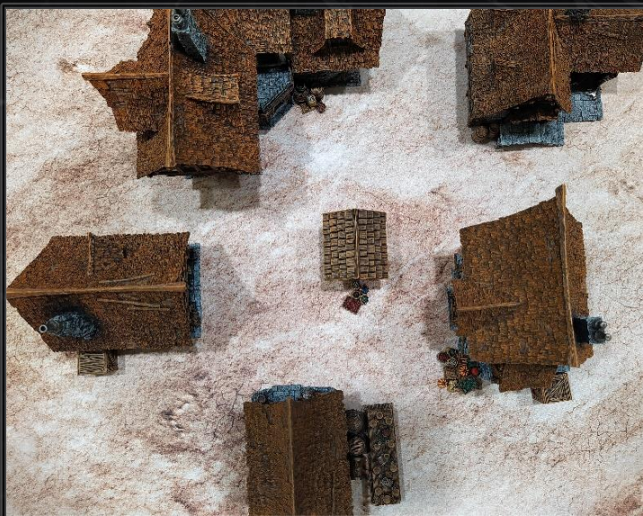
This is a decorated board to act as the Battlefield

Set up a Battlefield to play on. We recommend a flat, rectangular or square surface, but you can use anything and almost any size. Place some scenery on the Battlefield. Divide the board to suit the number of players, with a neutral 'no man's land' in the middle. For example, divide the board into 3 areas for a two-player game. Player areas are called Deployment Zones.