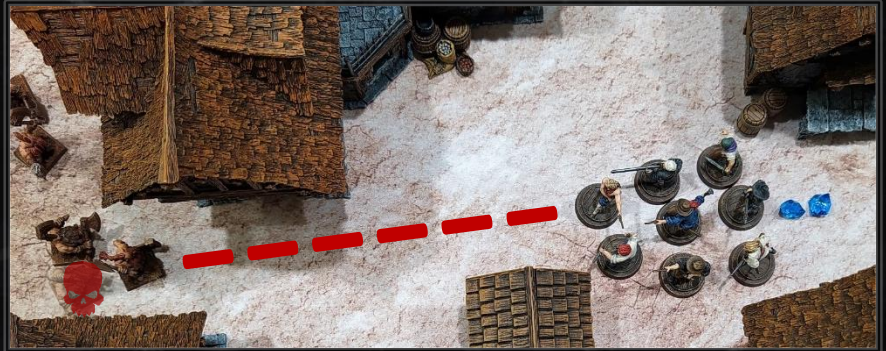
The Unit makes its second Action: 'Attack'